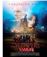
Flowers of War (2011)

EDMONTON ALPHA strives to educate those who want to learn more about the "Forgotten Holocaust" (1910-1945). Here are some websites worth exploring: