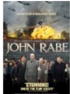
John Rabe (2009)